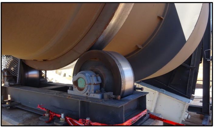
Northern Nevada Correctional Center Commercial Almond Shell Dryer