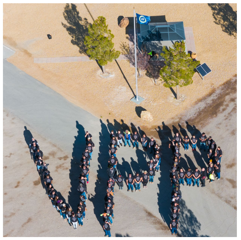
Republic Beatty Facility VPP presentation – December 2023